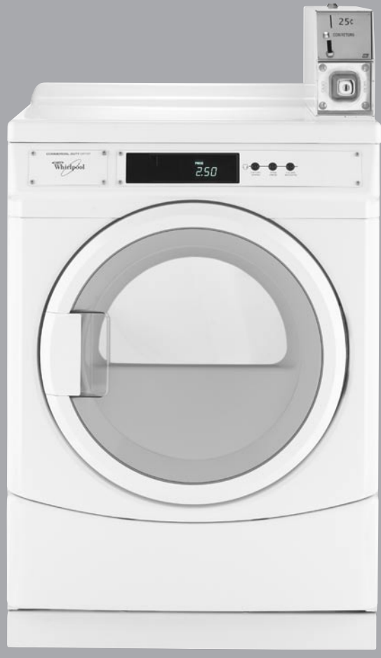
Shown with optional pedestal, coin drop and box.